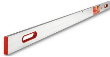
2. straight edge