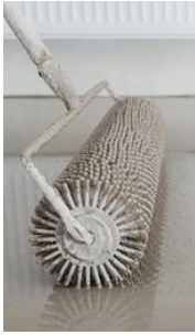
1. spiked roller

Match the pictures and the screed tools.